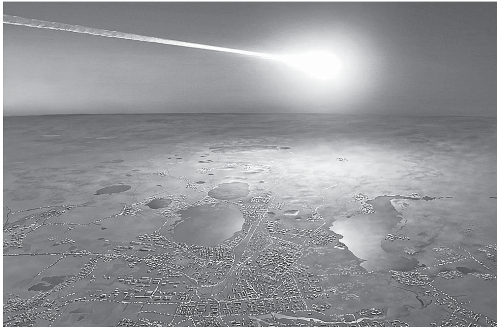
An artist's view of the Chelyabinsk "superbolide" event shows the meteor fragment which exploded over Russia last year. Credit: Don Davis for space.com

Between 2000 and 2013, this network detected 26 explosions on Earth ranging in energy from 1 to 600 kilotons—all caused not by nuclear explosions, but rather by asteroid impacts. To put that in perspective, the atomic bomb that destroyed Hiroshima in 1945 exploded with an energy impact of 15 kilotons. While most of these asteroids exploded too high in the atmosphere to do serious damage on the ground, the evidence is important in estimating the frequency of